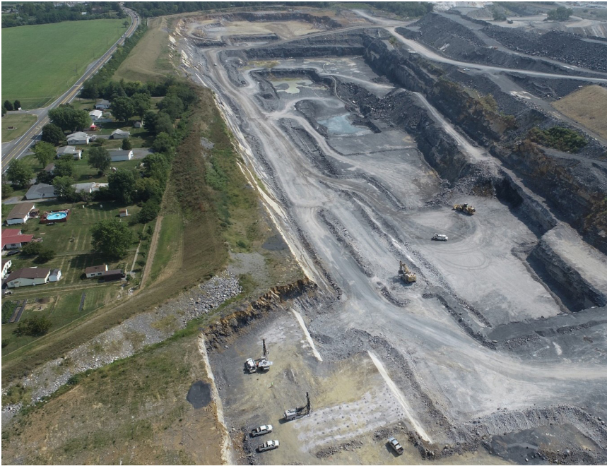
Neighbors just 300 feet from blasting